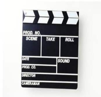
11 August 2016 — News story HMRC wins blockbuster tax avoidance cases

A collection of consultations around specific