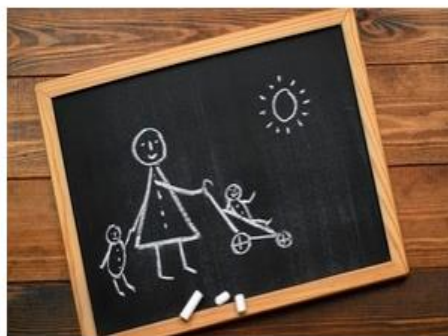
28 July 2016 — News story Tax-Free Childcare: Top things childcare providers should know

Top things childcare providers need to know about Tax-Free Childcare.