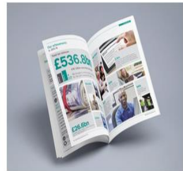
21 July 2016 — Corporate report HMRC annual report and accounts: 2015 to 2016