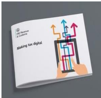
15 August 2016 — Collection Making Tax Digital: consultations

A collection of consultations around specific