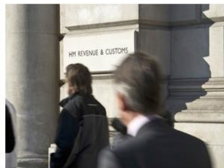
12 January 2016 — Corporate report Your Charter

Top things childcare providers need to know about Tax-Free Childcare.